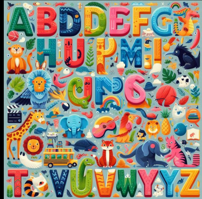
Bing Prompt: alphabet for primary school poster