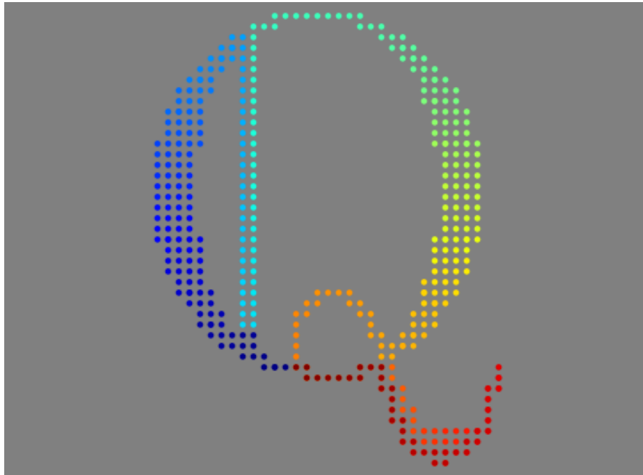
Figure 3: A 440 step base-4 walk on the number Q .

the rational Q = \frac{M}{N} generates a regular walk, which is also periodic , Fig. 3. (Do not confuse a periodic walk with a periodic expansion — the walk may not be periodic, but the expansion always is. For the walk to be periodic, it must return to the point of origin after the number of step which is integer factor of the expansion period.)