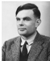
Alan Turing (1912–1954)

In the 1930s, a “computer” was a person who performed (arithmetic) calculations.