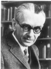
Kurt Gödel (1906–1978)

There is no consistent, complete, axiomatisable extension of \mathcal{Q} .